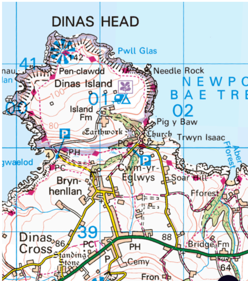
MAP OF ABERFFOREST, DINAS HEAD AND DINAS CROSS